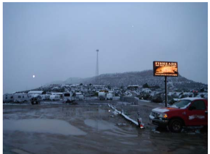
Early morning on the second day – snow and sleet the entire night before, but it warmed up quickly when the sun came out