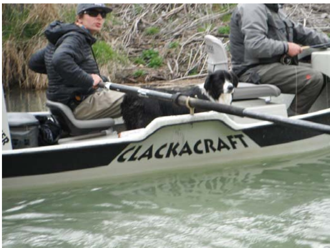
Best Guide on the River – the one in the black and white fur coat !